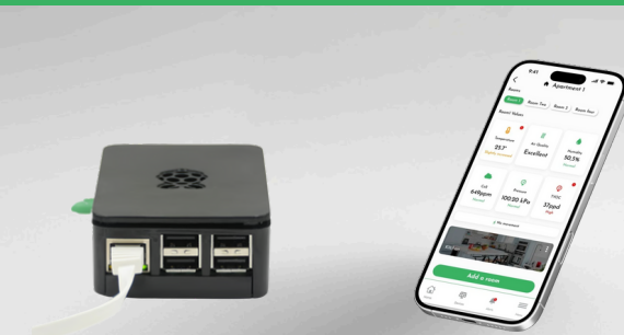
SQ - Connector

After setup, SQ-Panel works in Apple Home, Google Home, Alexa, SmartThings, Home Assistant (and more)—via the Matter standard—without needing the app daily.